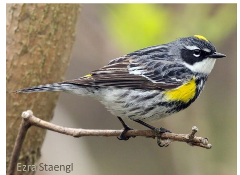
Ezra Staengl Yellow-rumped Warbler