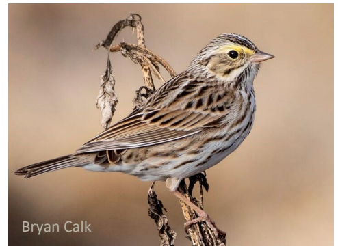
Savannah Sparrow