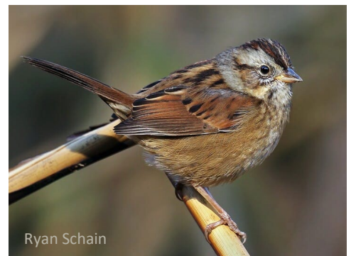
Ryan Schain Swamp Sparrow