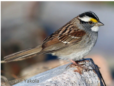
Keenan Yakola White-throated Sparrow