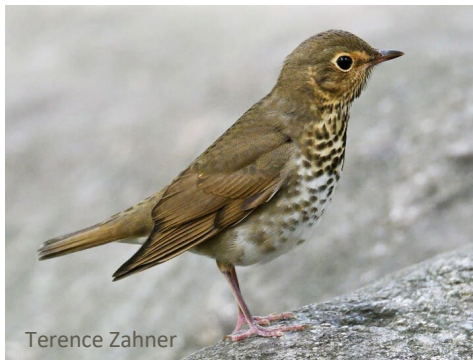
Terence Zahner Swainson's Thrush