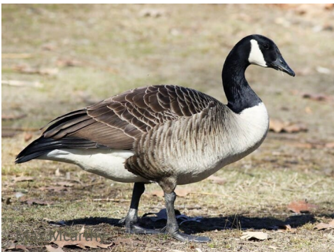
Micah Canada Goose