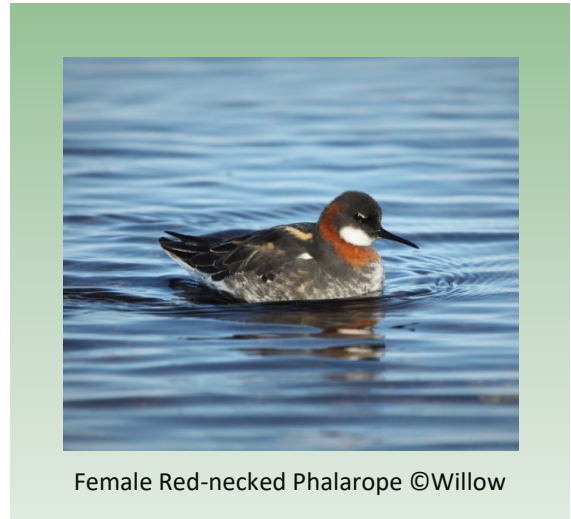
Female Red-necked Phalarope

This section of the proposed management plan for Red-necked Phalarope provides descriptive information such as what they look like, where they live and what they need to survive.